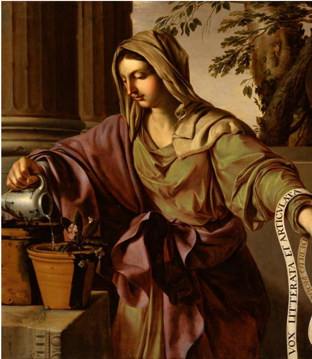
Laurent de la Hyre: Allegory of Grammar